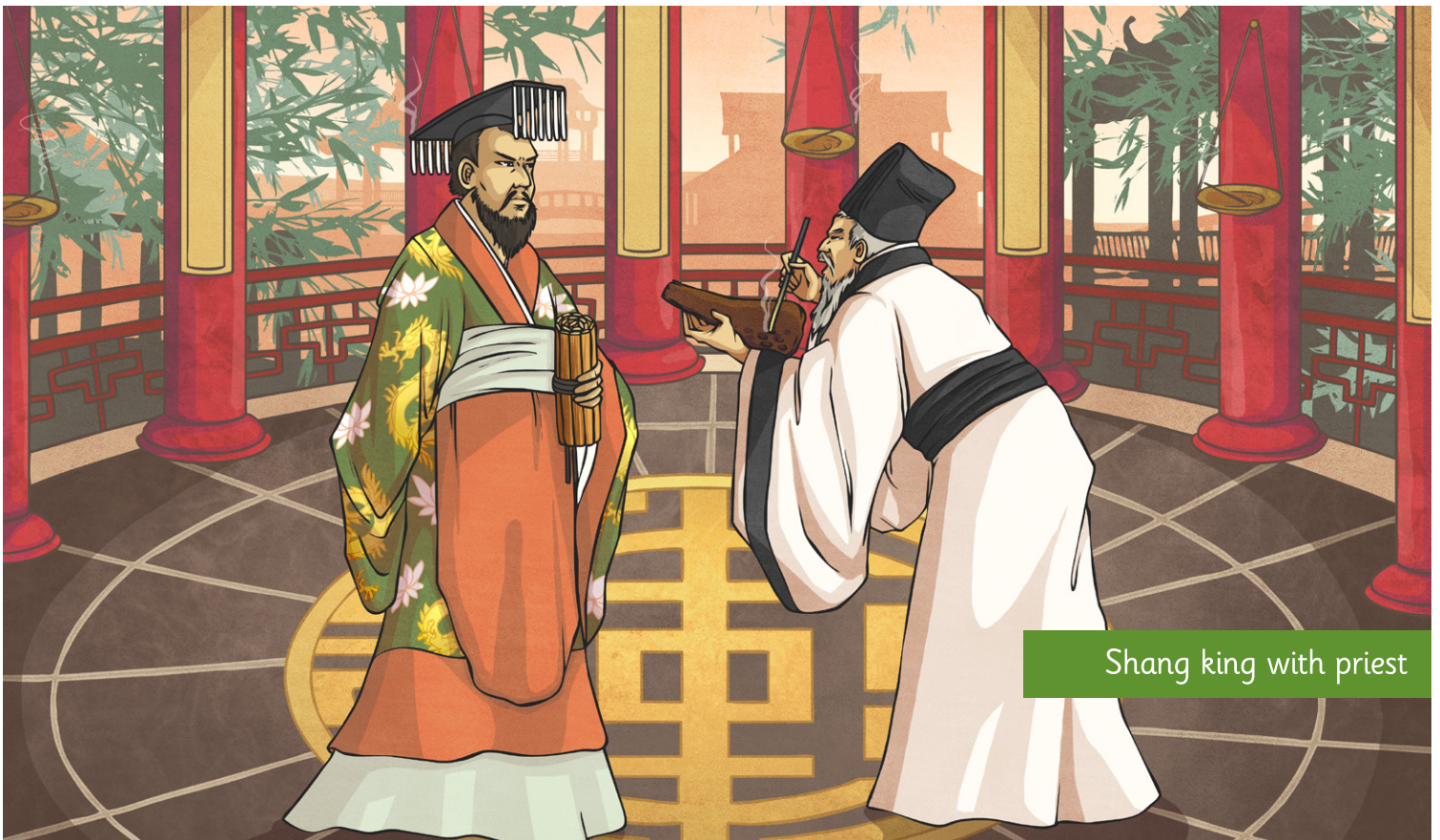
Shang king with priest